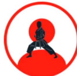
TO BE ANNOUNCED